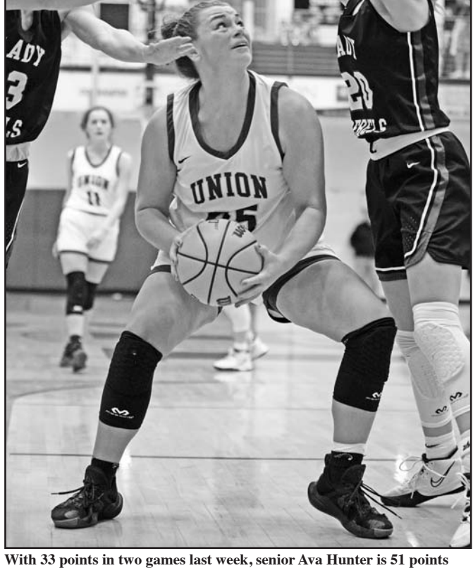
away from 1,500 for her career.

In the Fannin loss, Union County faced early deficits of 8-0 and 10-2 before a pair of baskets by Hunter moved the