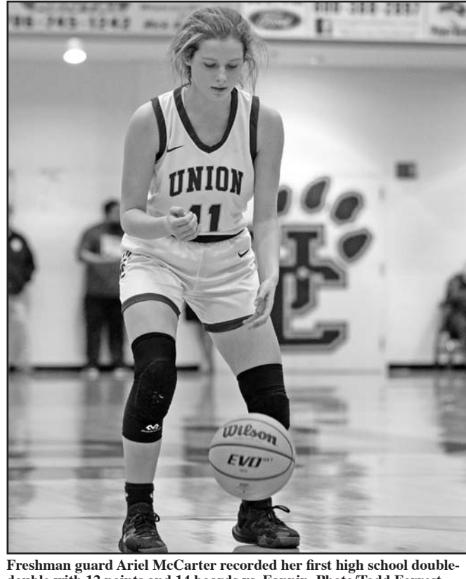
double with 12 points and 14 boards vs. Fannin.

Turner opened the third frame with a putback, but Fannin scored inside approximately 90 seconds later. McCarter split two free throws and Hunter converted an offensive board near the threeminute mark to keep the Lady canceled out a Fannin trey. Turner Panthers within a baker's dozen.